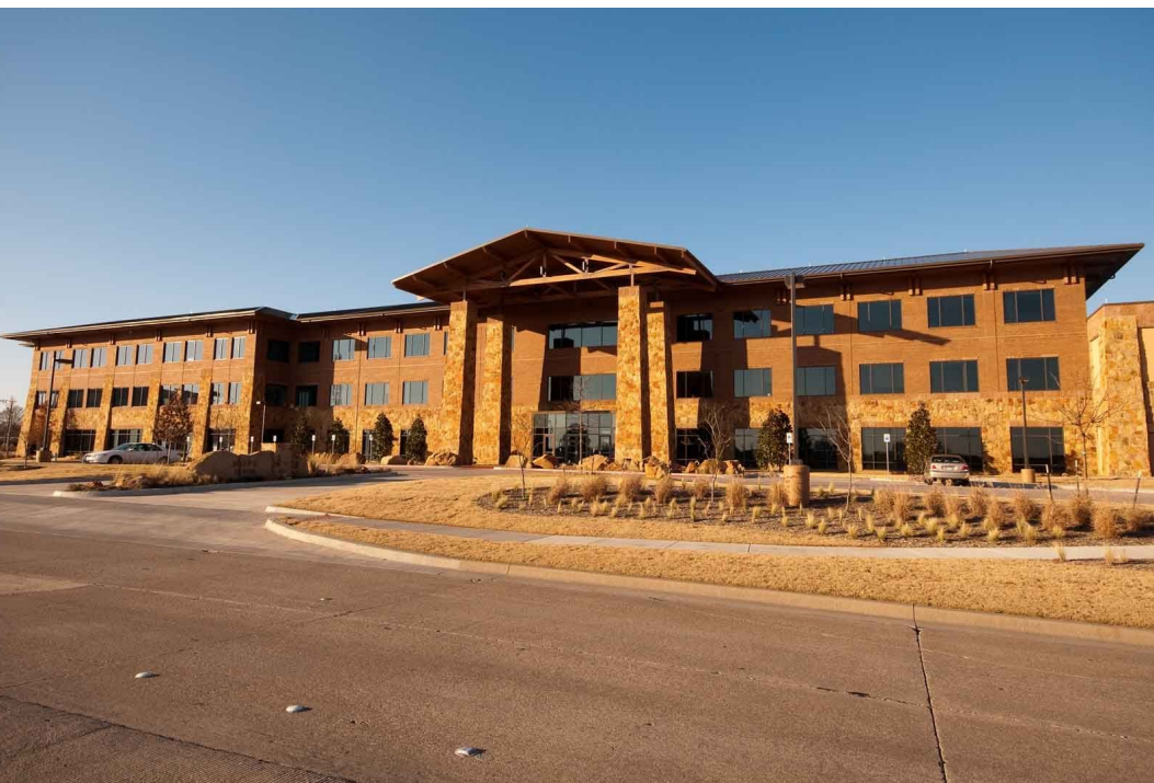
The Hope Center, Plano, TX